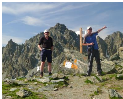
Tour de Mont Viso, Day 2. Passo Gallarino

These journeys through the high Alps have helped compensate for the lost excitement of the summit climbs of yesteryear. Long may they continue.