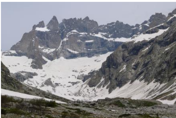
La Meije from the path to Le Plaret. Chatelleret Refuge just visible bottom centre

The European Alps have loomed large in my life. For the last forty years I have spent most of my holidays walking, climbing and skiing, most often in the Alps. Many of these explorations have taken place in the Écrins National Park in the South East of the Dauphine region. The legendary French mountain guide, Gaston Rebuffat, said of the Écrins that it was "sauvage, comme les premiers jours". He was not exaggerating.