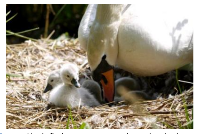
June: Hugh finds a great spotted woodpecker's nest in the woods by the river with a very noisy brood inside clamouring for insects and we spend several days watching from the undergrowth until the little ones leave the safety of their hollow tree trunk.