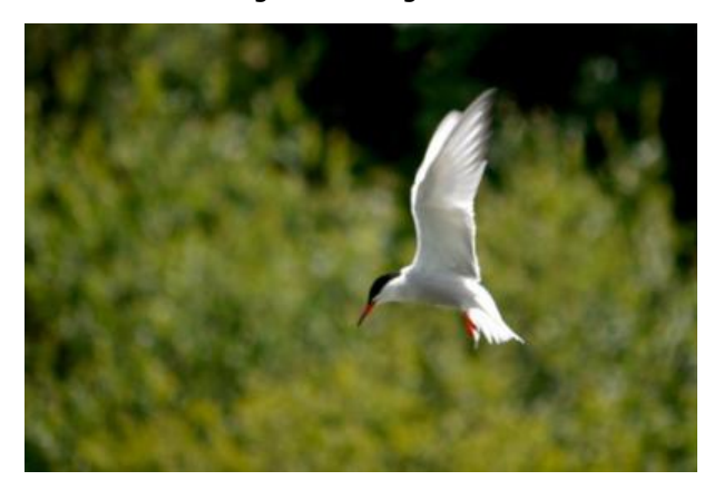
... and there are suddenly many new broods of young water birds.